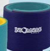
#119 CUSTOM COLOR JUNIOR