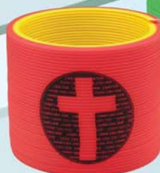
#110 INSIDE/OUTSIDE LARGE