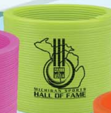
#115 DAYBRIGHT JUNIOR