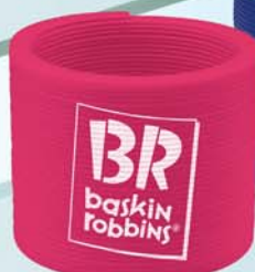
#122 CUSTOM COLOR LARGE