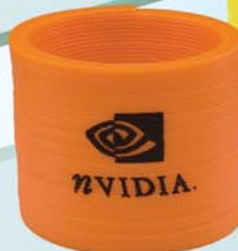
#110 DAYBRIGHT LARGE