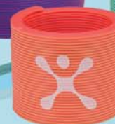
#115 LAYERED JUNIOR