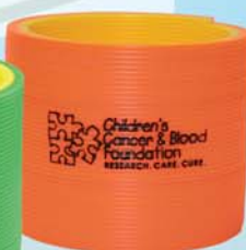
#115 INSIDE/OUTSIDE JUNIOR