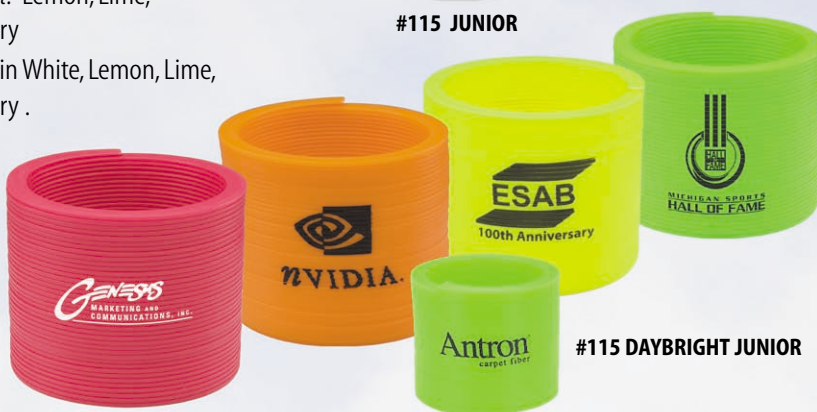
#115 DAYBRIGHT JUNIOR