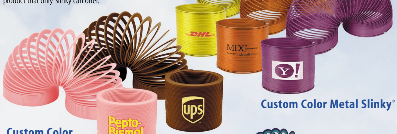
Custom Color Metal Slinky®

Have your Slinky made in company, team or school colors. Imprint a name, logo or slogan and you'll have a distinctive product that only Slinky can offer.