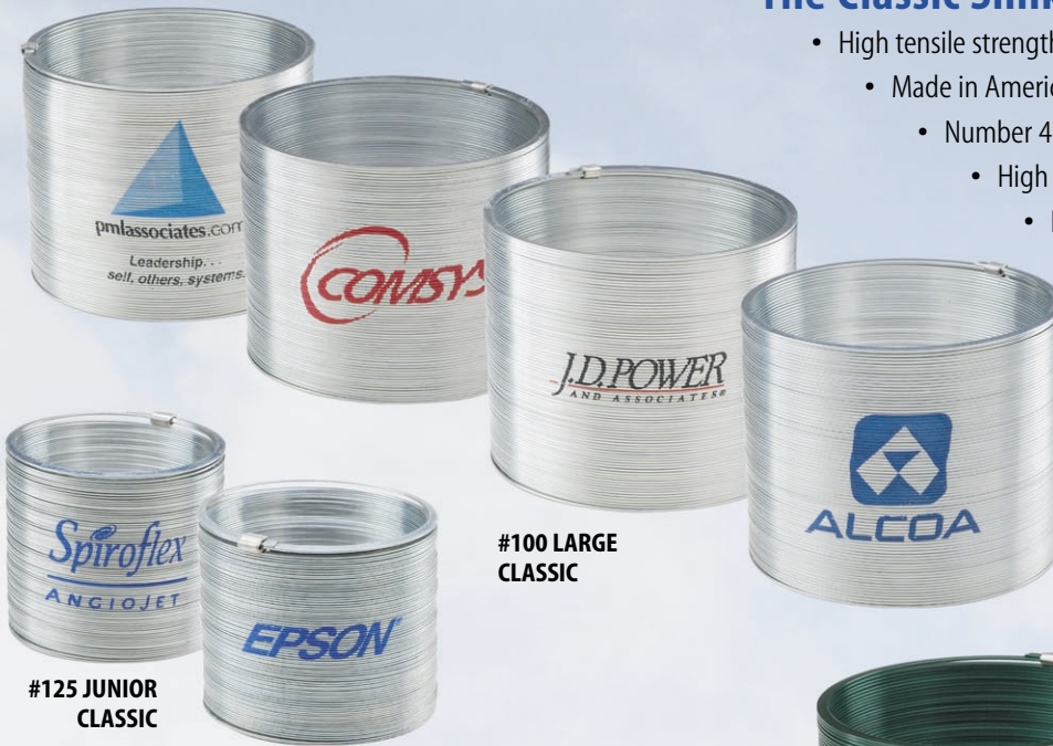
#125 JUNIOR CLASSIC