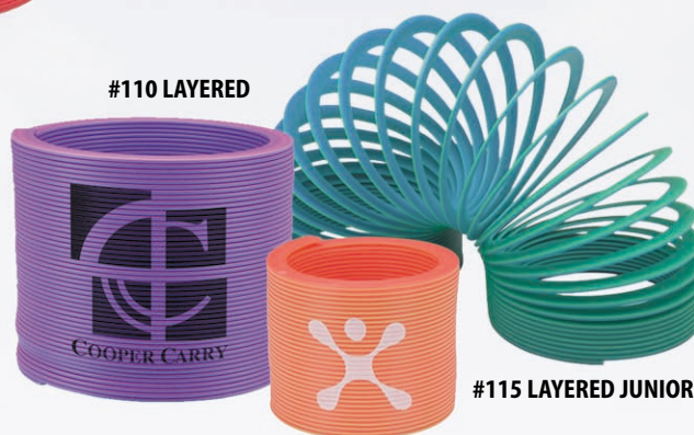
#115 LAYERED JUNIOR

Stock - One Color Plastic - Regular - Daybright - Inside/Outside - Layered 5R 250 500 1,000 2,500 5,000